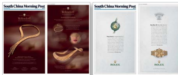
2-Page/ 4-Page Woodfree/ Art-paper Sleeve