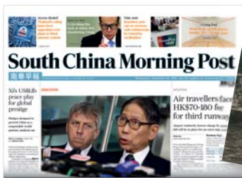
Loose/ Booklet Insert